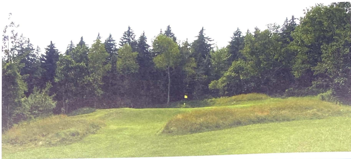
Above: Shaggy mounds cradle the first green. Right and below: Two views of the stunning waterside sixth at the North Haven Golf Club.